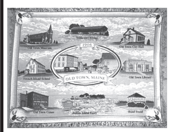
(Please include shipping costs)

Available in VHS ($5 each) or DVD ($15 each) tax inc., $2 shipping