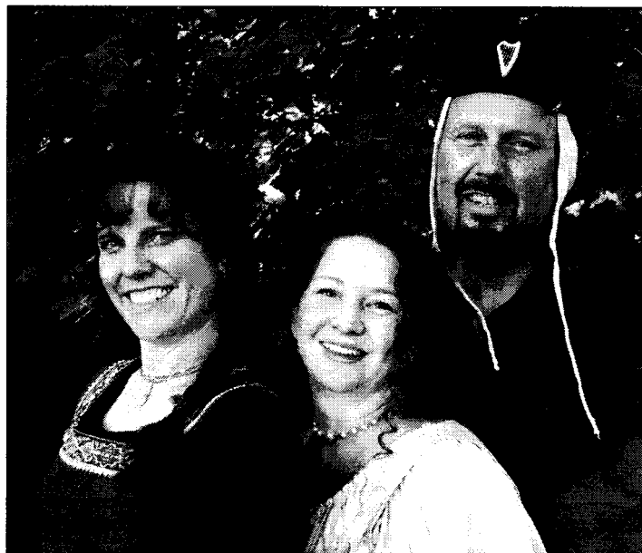
Port 'O Call, Maine's madrigal to sea shanty singing trio will perform at the Museum's first Sunday program for the 2010 season.

In addition to these programs, the Museum will have some fund raisers which include a Strawberry Festival at the Museum on July 10, a supper at the Museum with entertainment in late July or early August, and finally a Harvest Tea on October 17. We hope that the community will enjoy all of these times at the Museum. Please pass the word and we'll see you there!