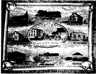
(Please include shipping costs)

Or send check to: Old Town Museum, c/o B. Csavinszky, 15 Sewall Drive, Old Town, ME 04468