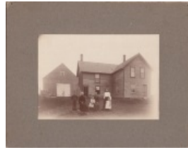
Unidentified Farmhouse [1904-1921] (OBJ.O.2004.56.3)