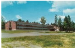
New Old Town High School [1950s] (Obj.N.2023.27)

Old Town High School [1910-1925] (Obj.N.2023.24)