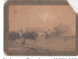
Unknown Farmhouse [1880-1920] (OBJ.N.2023.77)

Our Neighborhood Club [Members and Agenda 1937-1938] (OBJ.N.2023.78)