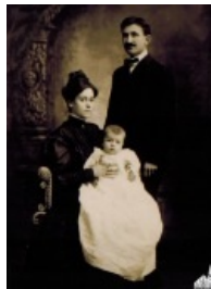
Desjardins [Family, 1906] (OBJ.N.2013.10)

Desjardins [Adding Machine, 1912-24] (OBJ.N.2013.1)