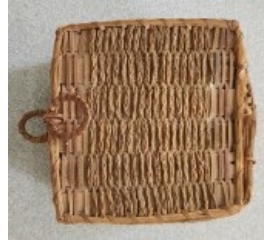
Small Native American-made basket with lid (OBJ.N.1984.250)

Stillwater Covered Bridge [Toll Receipts, 1857] (OBJ.N.1984.1)