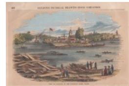
View on Indian Island [Gleason, 1854] (OBJ.N.1997.41)

St. Mary's Church (Old Town) [1940- 1960] (OBJ.N.1996.76)