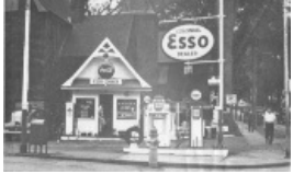
Esso Corner [ca.1950] (Obj.N.2020.46)