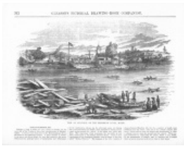
View on Indian Island [Gleason's, 1854] (OBJ.O.1976.17)

Hair Care - Child Barber Chair Booster Seat (OBJ.O.1976.2)