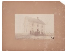
Unidentified Farmhouse with family [1896-1904] (OBJ.O.1988.111)