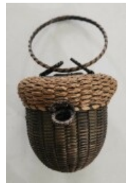
Native American-made acorn knitting basket (OBJ.N.1984.41)

The Penobscot Times' List of Tax Assessments (OBJ.N.1984.8)