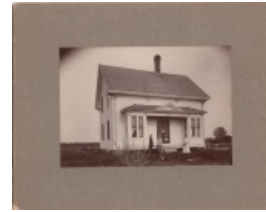
Charlie Dow House [1904-1921] (OBJ.O.2004.56.4)