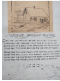
Sketch & Poem by Louis A. Heath [1948] (OBJ.O.1984.58)

Parker Bickmore? [Photograph] (OBJ.O.1984.249)