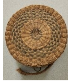
Native American-made fancy flat basket (OBJ.N.1984.251)