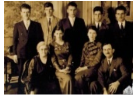
Desjardins [Family, 1933] (OBJ.N.2013.6)