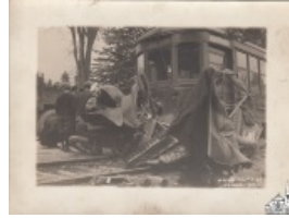
Old Town Trolley and Automobile Collision - Front (OBJ.N.2018.4)