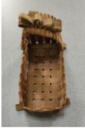
Native American-made doll cradle basket (OBJ.N.1988.148)