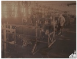
Interior American Woolen Mill [c.1910] (OBJ.N.2006.1)