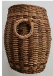
Native American-made basket (OBJ.N.1997.72)

Register of Postal Savings Certificates Paid at Old Town, Maine [Jul. 3, 1911- Sept. 1918] (OBJ.N.1997.63)