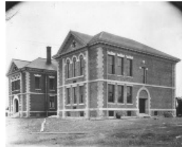
Old Town High School [1925] (OBJ.N.2023.67)