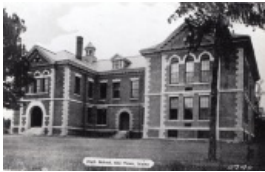
Old Town High School [photo of postcard] (OBJ.N.2023.66)