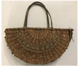
Native-American made basket (OBJ.N.2016.20)

Box with Blank Baby Book [1913] (OBJ.N.2016.3)