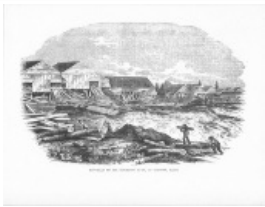
Saw Mills on Penobscot River [Gleason's, 1854] (OBJ.O.1976.16)

Sam Harris Barbershop [Interior, 1890-1920] (OBJ.O.1976.13)