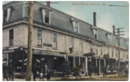
Folsom Block [Old Town, 1907-1912] (OBJ.O.1992.112a)

State of Maine Report of Inspection [1910s] (OBJ.O.1992.108b)