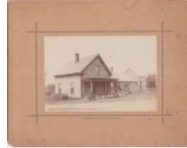
Unknown Farmhouse with Family [1896-1904] (OBJ.N.2021.76)

Strike at Penobscot Shoe Co. [1940s] (OBJ.N.2021.8)