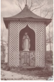
Outside Altar [c.1910] (OBJ.N.2022.27)

Menu folder from the March 30, 1891 Penobscot Club Banquet (OBJ.N.2022.3)