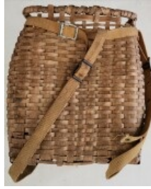
Native American-made pack basket (OBJ.N.1989.142)