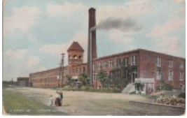
Old Town Woolen Co. Mill [1906-1909] (OBJ.N.2023.85)