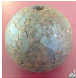
Cannon Ball [1861-5] (Obj.N.2015.1)

Old Town High School Graduation Program [1929] (Obj.N.2014.9)