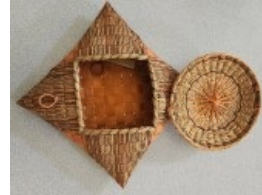
Native American made handkerchief basket (OBJ.N.1989.143)