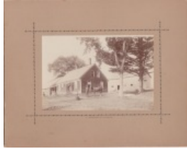
Unknown Farmhouse with Family and Horse [1896-1904] (OBJ.N.2021.75)