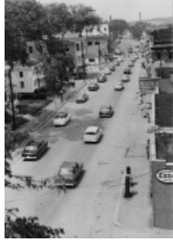
South Main Street [1954] (Obj.N.2020.47)