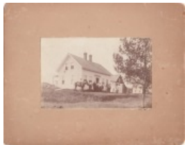
Freeze House [1896-1904] (OBJ.O.1988.108)