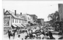
Parade going north on N. Maine Street [1941] (OBJ.O.1977.18)

Moving the Treat and Webster Island Bridge [Photos (3)] (OBJ.O.1977.13)