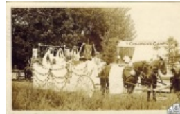
4th of July Parade Floats [1916] (OBJ.N.2022.21)

Novelty H.M. Burnham Postcard [c.1910] (OBJ.N.2022.22)