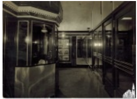
Interior of Strand Theater (1939) (OBJ.O.1996.125)

Blotter [1910s-30s, approx.] (OBJ.O.1996.120)