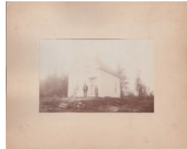
Unknown House with family [1896- 1904] (OBJ.N.2023.79)

Our Neighborhood Club [Members and Agenda 1937-1938] (OBJ.N.2023.78)