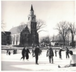
Skating Rink at St. Joseph's Playground [1950-1980] (OBJ.N.2019.51)