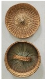
Native American-made fancy flat basket (OBJ.N.1984.252)