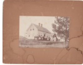
Freeze House [1896-1904] (OBJ.O.2004.56.6)