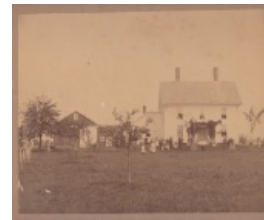
Sanborn Residence [1896-1904] (OBJ.O.1988.107)