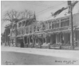
Folsom Block [Fire, 1935] (OBJ.A.2001.12)