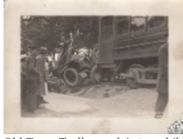
Old Town Trolley and Automobile Collision - Side (OBJ.N.2018.5)

Myrtle Rebekah Degree Lodge [Constitution] (OBJ.N.2018.6)