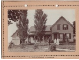
Keniston House [1896-1904] (OBJ.N.2023.76)

Bickmore Letterhead [1895] (OBJ.N.2023.75)