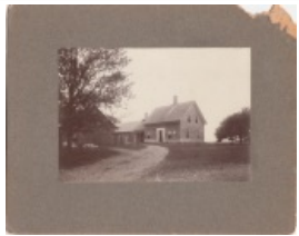
Farmhouse with Barn [1904-1921] (Obj.A.2010.9)

Charlie Dow House [1890-1920] (Obj.A.2010.14)